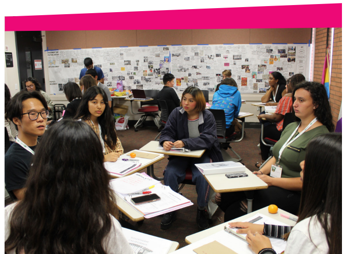
GSA youth leaders from Southern California discuss issues impacting trans and queer students during a peer group discussion in Los Angeles in 2019.