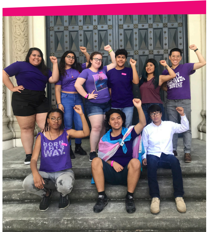
Students from across the state of California came together in the Spring of 2019 to advocate for implementation of the California Health Youth Act (CHYA), new legislation that will ensure that students can receive comprehensive sexual education.

At their core, LGBTQ+ youth and trans and queer young people of color want to build community in this moment. They are searching for places that affirm their identities and experiences, uplift their spirit, and promote self and