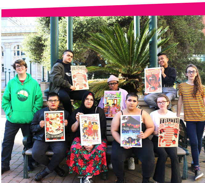
The National Trans Youth Council (TRUTH) developed a Nine Point Platform that guides their vision and work for liberation. In 2020, they are organizing for the abolition of the police, ICE, borders, and the Judicial System.