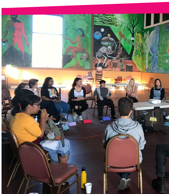
Trans and queer youth leaders are organizing