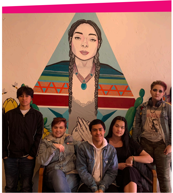
The Central Valley Youth Council joins together in December 2019.