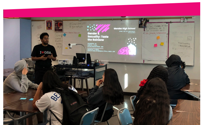
GSA Network staff host a workshop to trans and queer students in Southern California.