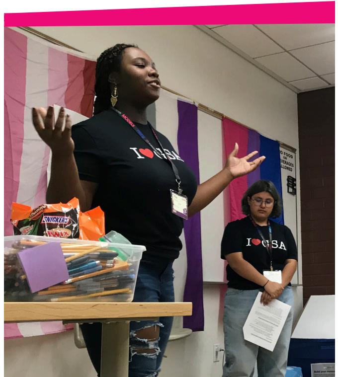
Members of GSA Network's Youth Councils host a series of workshops focused on community organizing, advocacy, and racial and gender justice.

Reach Out to Your Contacts. Text or message friends who were in the club before. Do they have the contact info of others in the club last year? Do they know someone else who is looking for a place to hang out online with other trans and queer teens? If you have an advisor, reach out to them and ask for the student contact list. They may be able to give you their school email addresses.