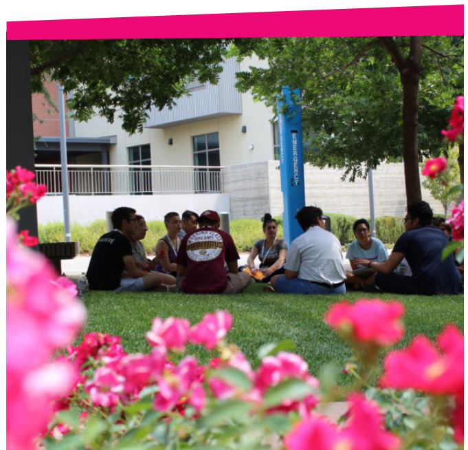
A group of GSA youth leaders engage in conversations about racial and gender justice, community organizing, and advocacy during GSA Activist Camp in 2019.