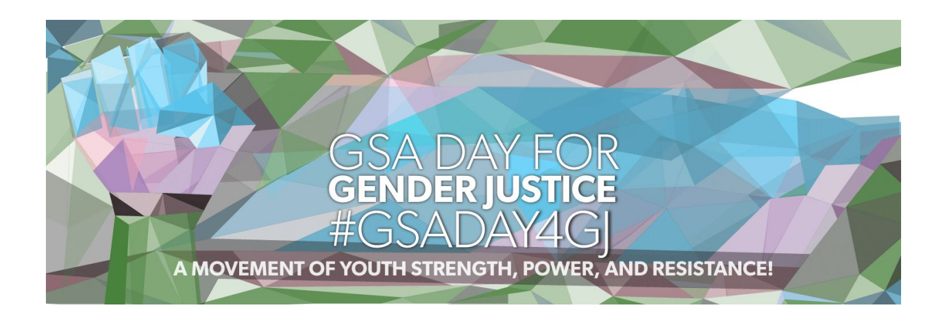
Workshop 2: Intersectional Gender Justice (1 hour)