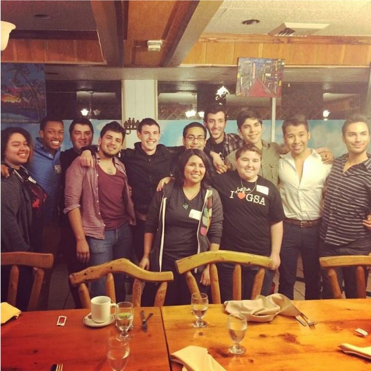
On Saturday March 15 th , GSA Network hosted its annual Expression Not Suppression Conference at Edison High School in Fresno. Although our conference is geared toward youth currently in GSAs, we also wanted a