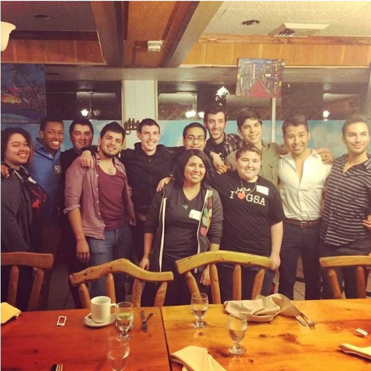
On Saturday March 15 th , GSA Network hosted its annual Expression Not Suppression Conference at Edison High School in Fresno. Although our conference is geared toward youth currently in GSAs, we also wanted a