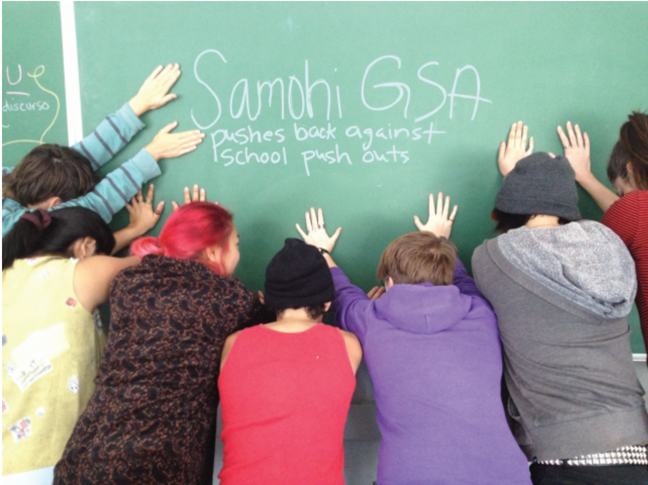
Sec A Image:

GSA's shared the message: #GSAs4justice push back against #SchoolPushout!