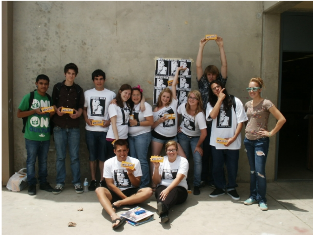
Golden West GSA in the Central Valley rocked T-Shirts and gave out Milk Duds

In honoring Harvey Milk Day and making it a day of activism and education, GSA activists are fighting to bring Harvey's dream of full equality for LGBT people to communities throughout California. From Pomona to Dinuba, the victories GSA activist youth win everyday in their schools are proof that the cause Harvey gave his life for is alive and well. Let's keep Harvey's dream alive everyday by working to make our schools and communities safe and accepting places for all LGBT students.