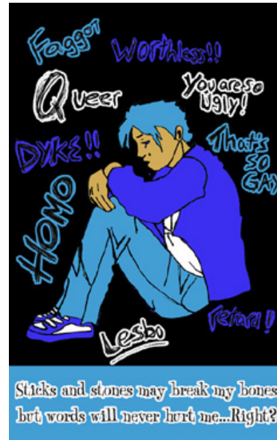
a Liberation Ink Poster