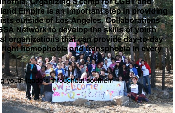
Participants and staff of Q Camp 2009,

[1] https://gsanetwork.org/events/trainings-and-summits