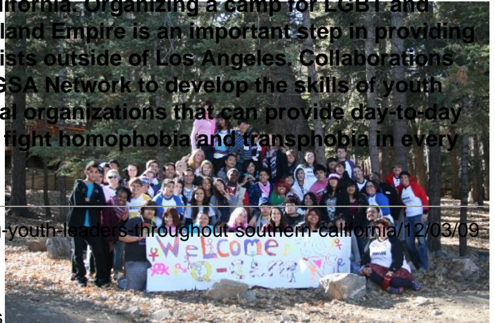
Participants and staff of Q Camp 2009,

[1] http://gsanetwork.org/events/trainings-and-summits